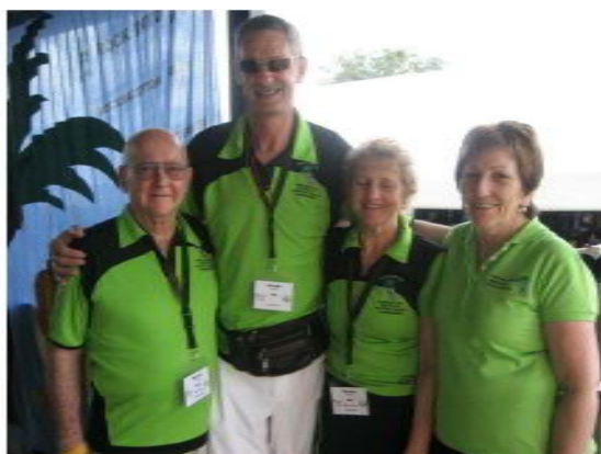
The Green Machines

"But I could be dead by then" No problem , if your wife lets us know we'll cancel the appointment